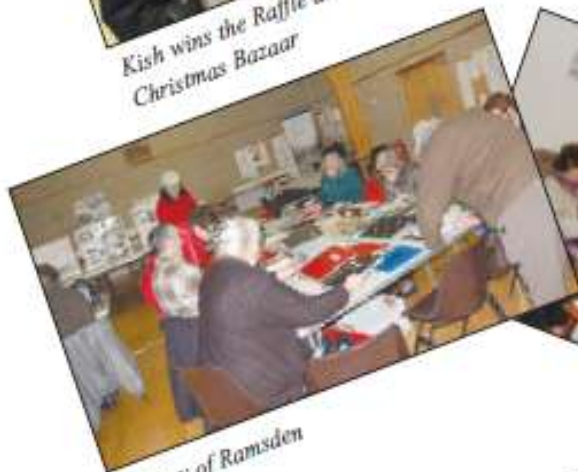
History of Ramsden