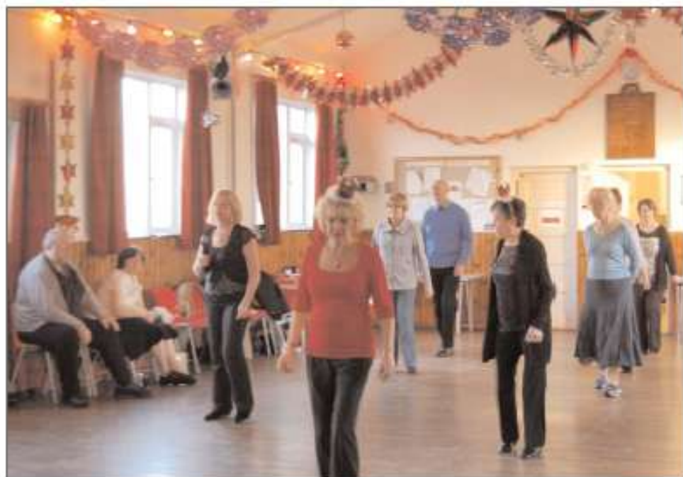
Line Dancing at Christmas Party