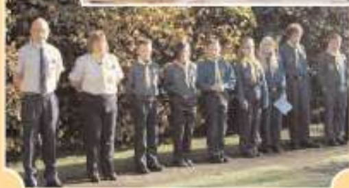
Scouts at Remembrance Sunday