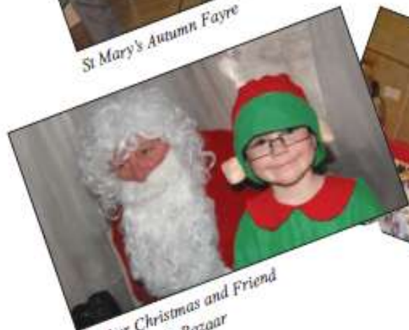
Father Christmas and Friend at Christmas Bazaar