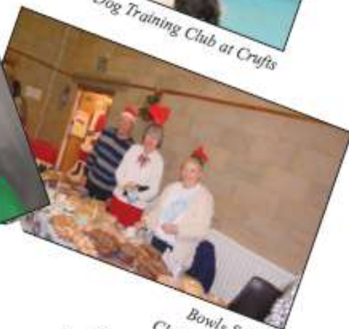
Bowls Stall at Christmas Bazaar