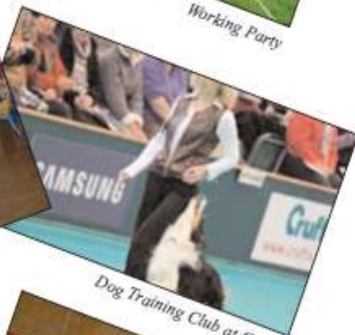
Dog Training Club at Crufts