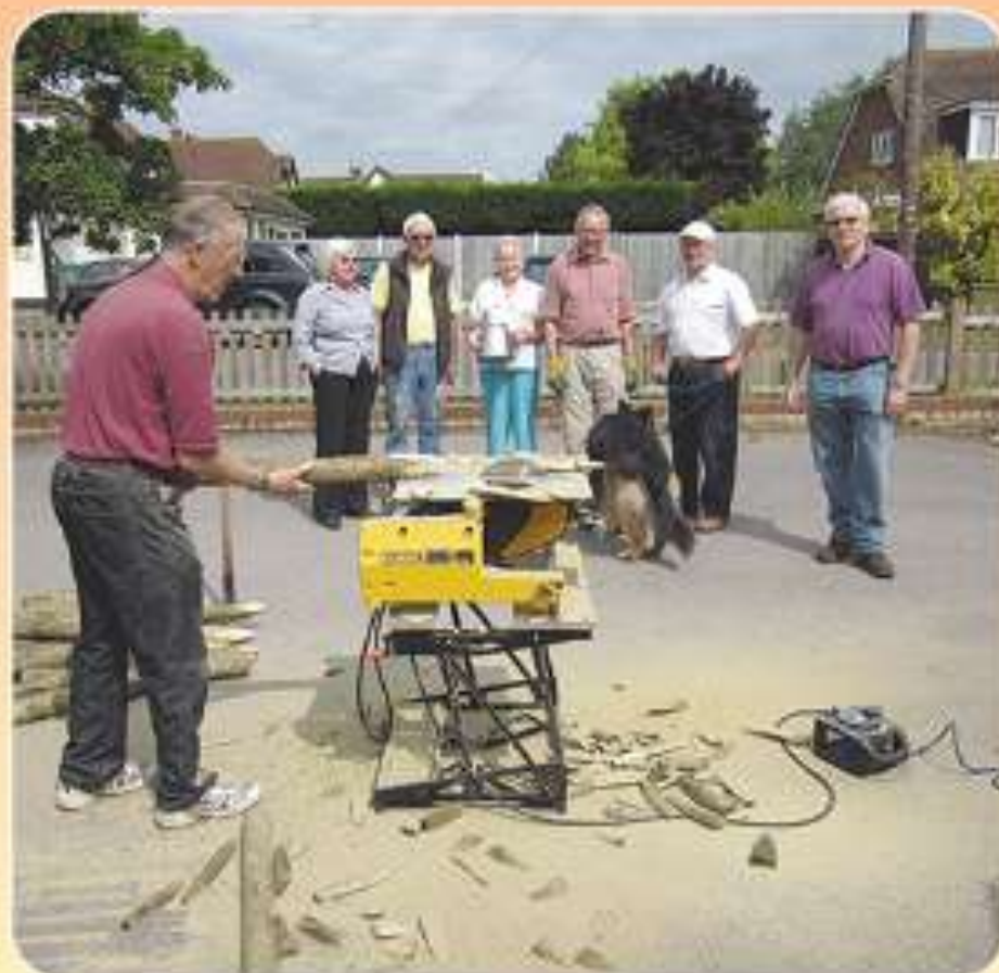
Working Party Village Hall