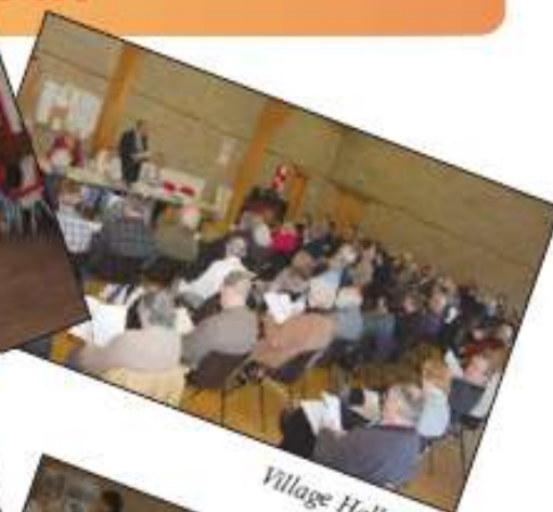
Village Hall AGM