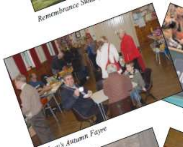
St Mary's Autumn Fayre