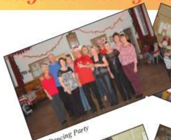
Line Dancing Party